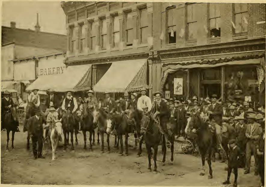
FRONTIER DAY STREET SCENE.